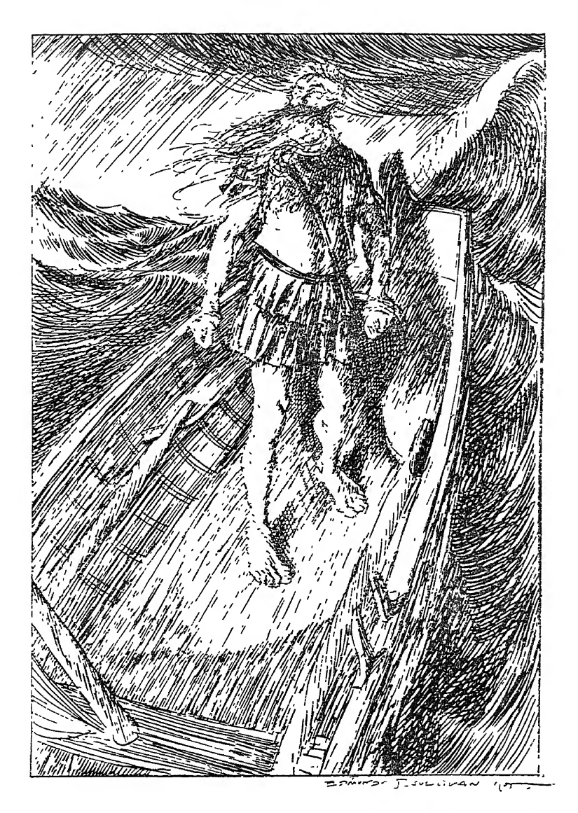
"How near men might come to the high distances of God" (see p. 310) To face page 258.